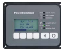
PowerCommand 1.1 control operator/display panel - Standard