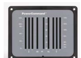
AC output analog meters - Optional