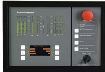
Optional features shown