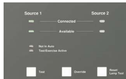
Basic indicator panel