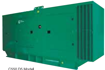
C550 D5 Model