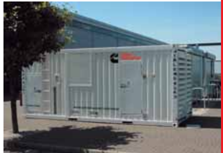
C1250 D2R PowerBox 20X