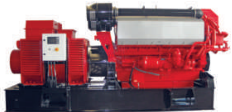
QSK60 Offshore Power Module