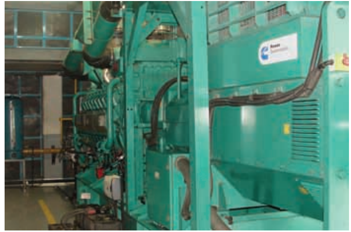
By getting both electricity and heat from natural gas, the company spends less on energy than before it installed the CHP system, while solving its voltage stability problems and reducing total emissions.