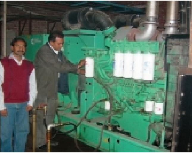
Installation of C1100 D5 generator set