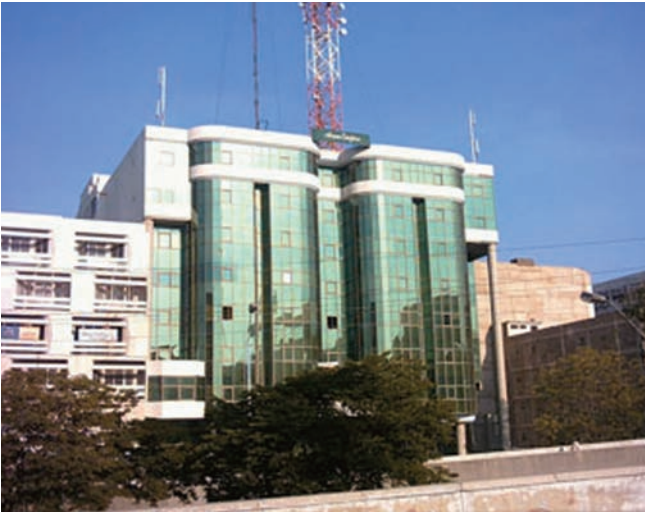
Telenor Pakistan headquarters