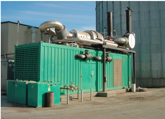
FIGURE 1 – Custom packaged lean burn natural gas CHP system.

According to the DOE, the new grid infrastructure must be centralized, yet able to operate in isolated sections. This means providing power to a smaller area disconnected from the primary grid, during a failure event. This microgrid structure will require that the grid be able to integrate distributed generation sources that are not usually on the grid during normal conditions. If implemented, the Smart Grid will grow the distributed generation business where small generators and renewable energy sources located close to the load will be the prime source of power during interruption of traditional utility power. These distributed sources can include CHP (Combined Heat and Power) plants and peak shaving generators located in industrial facilities as well as local peaking plants.