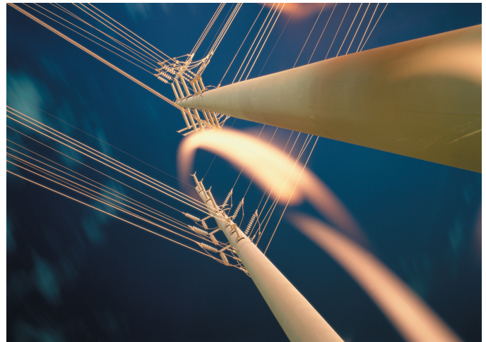
FIGURE 2 – Next generation superconductive power cables could reduce line losses and carry 3-5 times more power.

Advanced network sensing and modeling devices, combined with digital controls will transform the human grid operator's role into more of an observer of the system. Since human error is the most common form