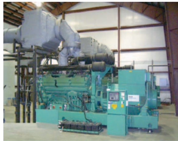
Figure 3 - A high-range generator set with an SCR system (gray insulated equipment) installed above it.

As with any technology, proper operation and maintenance of the engine and aftertreatment are required to ensure that the systems perform reliably. Failure to follow the manufacturer's recommendations can result in engine and aftertreatment system damage, which can adversely affect the reliability of a system. Proper operation and maintenance will help ensure that these systems perform properly in their critical applications.